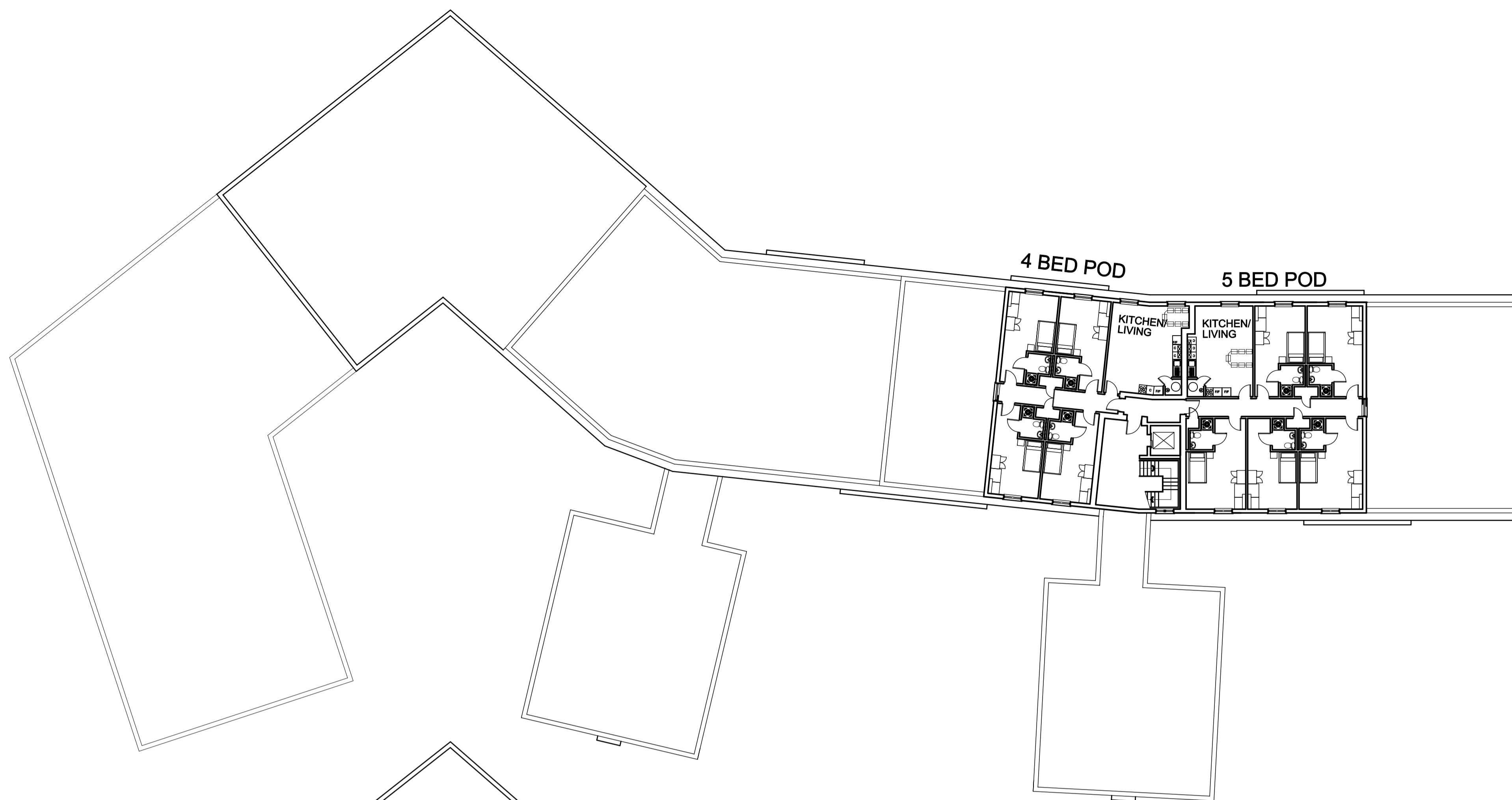
6TH FLOOR: 2 PODS/FLOOR - 9 BEDROOMS